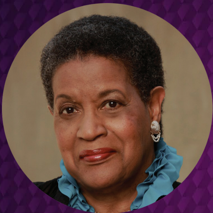
Mrs. Myrlie Evers-Williams